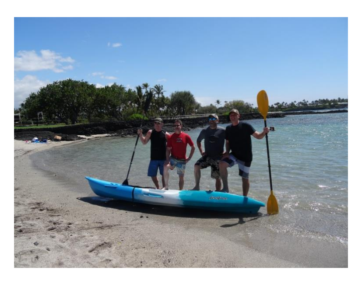
To the surprise of few, the North was victorious again!